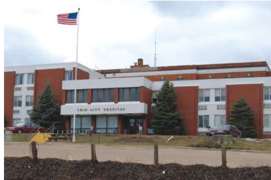
Twin City Hospital