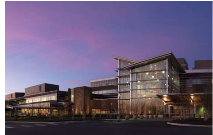
Dublin Methodist Hospital

When critical care transportation to or from DMH is needed, MedFlight can respond with our Columbus-based Mobile Intensive Care Unit (MICU) or medical helicopter. MedFlight's regional bases can also serve as backup, since DMH is strategically located between multiple bases.